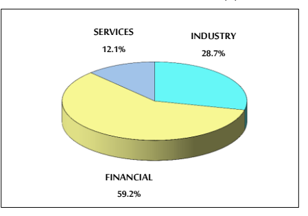
GENERAL FREE FLOAT PRICE INDEX FROM 21/3 TO 3/4/2019