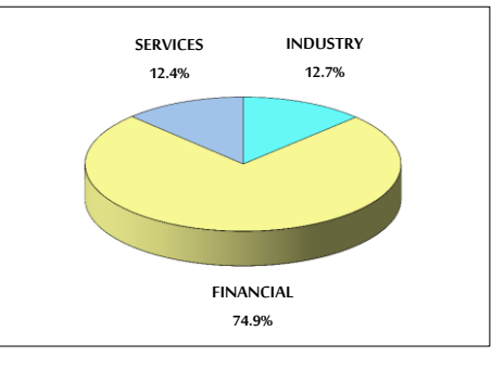
GENERAL FREE FLOAT PRICE INDEX FROM 22/1 TO 4/2/2019