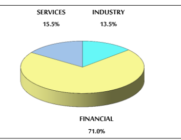
GENERAL FREE FLOAT PRICE INDEX FROM 3/5 TO 19/5/2021

VALUE TRADED BY SECTOR WEDNESDAY 19/5/2021